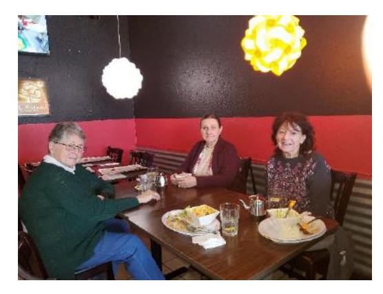
March Lunch at Sunset Thai