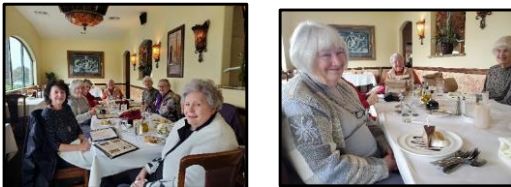
Rosa's Lunch in February.

Lunch Bunch will be meeting at a different restaurant in March. Sunset Thai is located at 561-5 Cities Drive in Cal Fresh center in Pismo Beach. It is to the left of Cal Fresh. The food is quite good, especially the papaya salad and the location is convenient. Consider carpooling and send your RSVP to Carole Dempsey at medipharmix@aol.com .