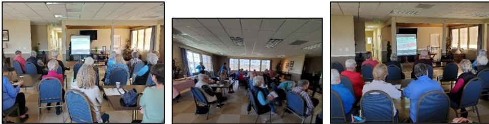
February General Meeting: Project 2025 and AAUW Public Policy Priorities