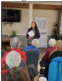
San Luis Obispo Guests