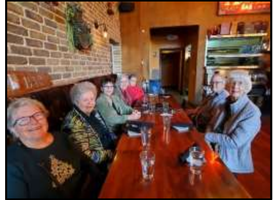
Photo at Masons December Lunch Bunch