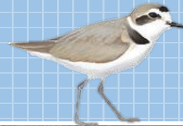
Linda Lidberg A Grand Master! (See Spotlight, pg. 6)

Check out the 5-Cities Pismo Beach Facebook page: https://www.facebook.com/profile.php?id=100072143045075