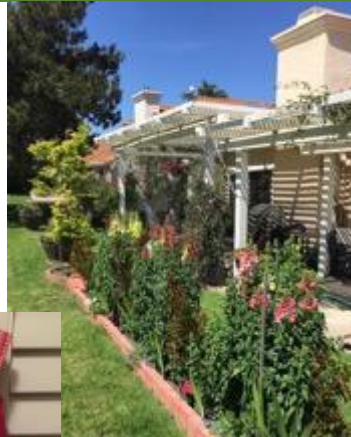
Above: Gayle's new flower garden