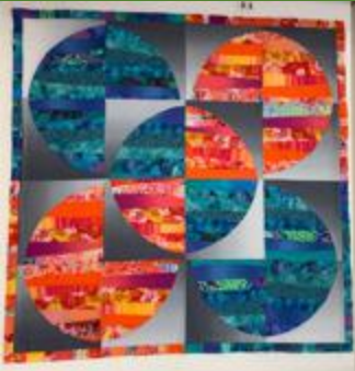
Left: Priscilla's beautiful and unique art quilt