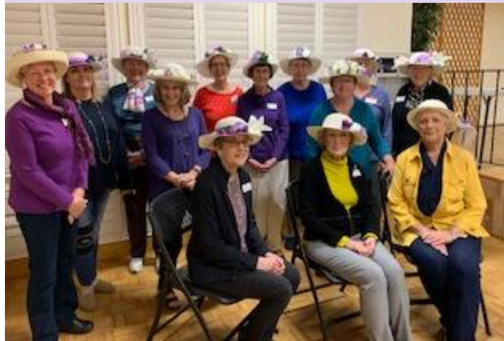
White hat ladies at Five Cities-Pismo Beach AAUW General Meeting, February 17, 2020